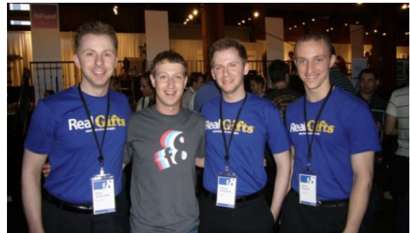
RealGifts Team with Mark Zuckerberg (Facebook's Founder and CEO)

RealGifts is a technology company delivering an award-winning social gifting platform that is defining social commerce. RealGifts takes virtual gifting to the next level by coupling a real gift along with a virtual gift, enabling users to send real, tangible gifts to their friends without needing their address. Combining virtual gifting and eCommerce, RealGifts provides a whole new way for social networks to monetize.